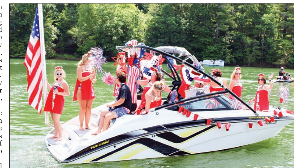
A particularly patriotic boat decorated for the Nottely Boat Parade in 2021.

'The fireworks show will probably last anywhere between See Fourth of July, Page 2A